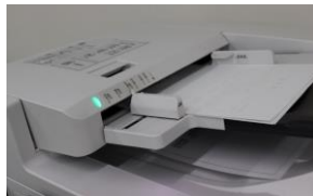
Asset Label Signage