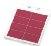
RICOH EH DSSC2832b