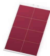
RICOH EH DSSC5284b

RICOH has succeeded in solidifying the electrolyte. The solidified electrolyte eliminates the risk of leakage due to aging, ensuring safety and high durability.